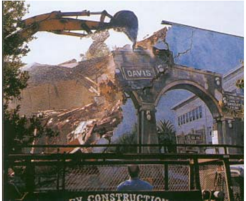
The demolition of the Terminal Hotel Building and the Arch Mural on the North wall, This picture taken from the cover of John Lofland's book, "Demolishing a Historic Hotel, A Sociology of Preservation Failures in Davis, California." It is rather graphic by itself.

The problem, of course, is that there is no way to make a "didactic display" of the building and the mural without offending a great many people. The interesting part will be: Who will they decide to offend?