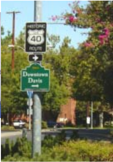
Above is one of the "Historic US Route 40," located on the corner of Russell and B Streets.