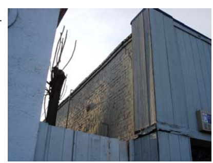
Visible old age